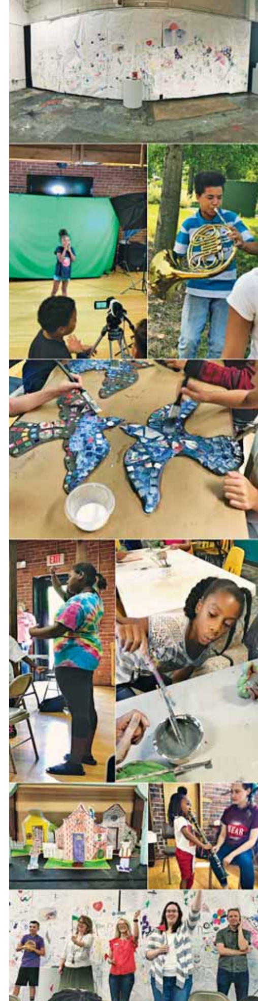
photos: Arts in the Park 2018