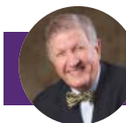
Dr. Guy Webb Education Award