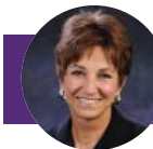
Dr. Gloria Galanes Leadership Award