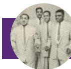
The Philharmonics Legacy Award