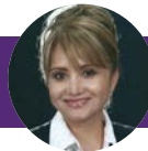
Yolanda Lorge Leadership Award