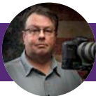
Steve Snyder Regional Impact Award