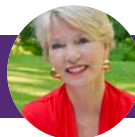
Chyrel Miller Education Award